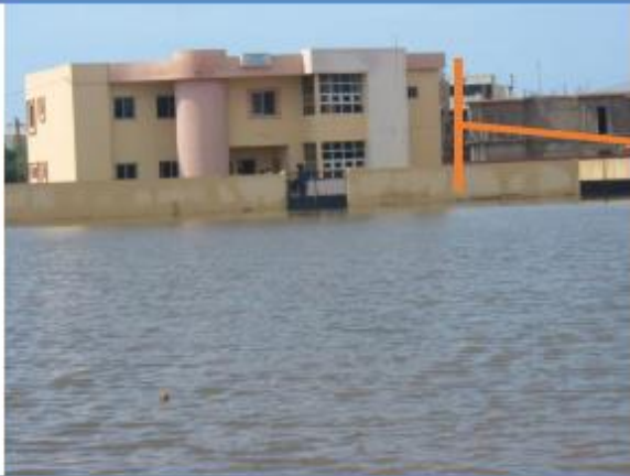
Municipality headquarter (before)