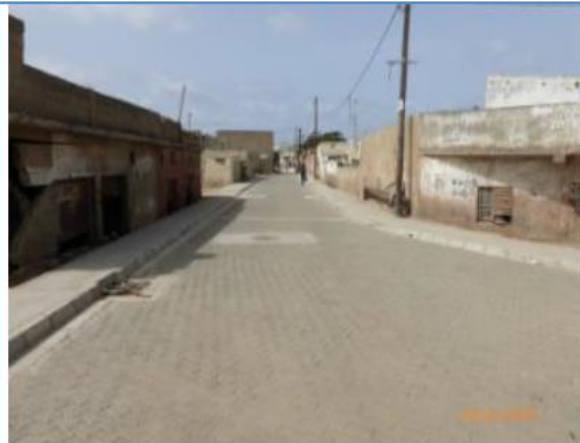
Groundwater and stormwater problems resolved after drainage work