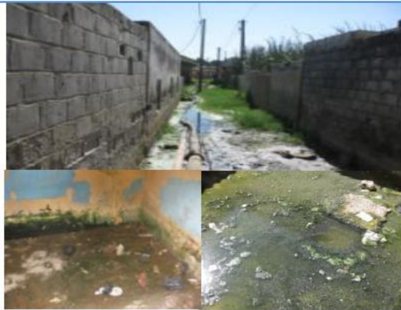
Groundwater overfloting in Cheikh Sy area