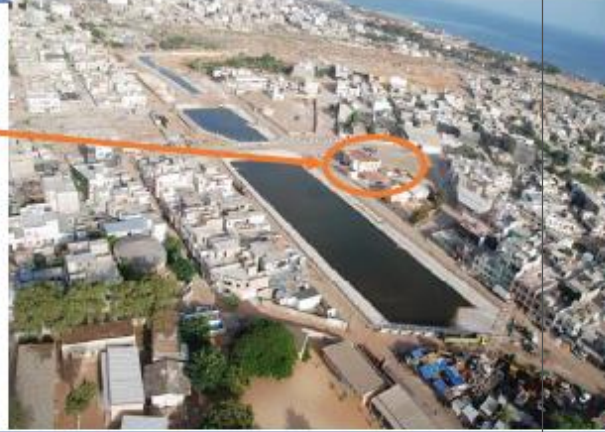
Municipality headquarter (after)